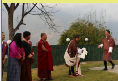
Reception of Honble Secretary DDC