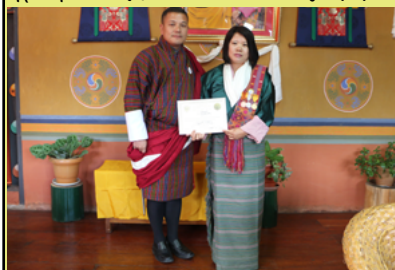
Civil Service Award Gold Medal